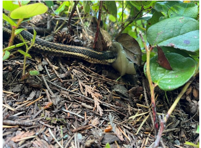
Garter Snake eating a slug